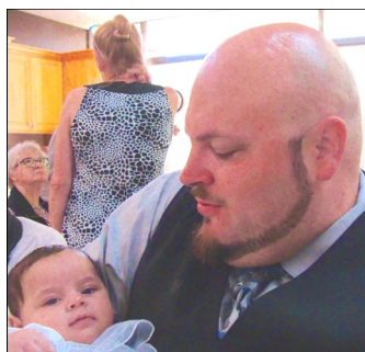
Father and daughter... caught in a special moment.